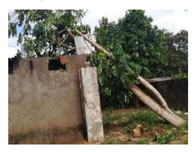
Images of the damages caused by cyclone IDAI to WASH facilities in Chimoio, Manica and Gondola, Mozambique

Mozambique was hit by the cyclone Idai, which landed on 14 March 2019 in Beira. It caused at least 1,300 casualties and over US$ 773 million in damages. A state of emergency was declared. The newly constructed F4WASH infrastructure in Beira Chimoia (ten schools) and in Phase 1 schools in Beira, Chimoia, Manica and Gondola (34 schools) were severely damaged. In Beira, all toilet blocks lost their roof sheets, front walls fell, and septic tanks were filled up due to the extreme rainfall. Toilet doors taps and water tower tanks were stolen as school guards could not work during and right after the storm. In Chimoia, Manica and Gondola the damage was less severe, but 40% of the toilet blocks lost their roof sheets and all septic tanks were full. More than 131,000 school children and people in the surrounding communities were at risk due to a cholera outbreak. Unaffected schools were used as shelter or distribution centres for emergency supplies. On 27 March, a rapid damage inventory was done. Based on this assessment, an additional funding proposal was submitted to VEI, Aqua for All and Wetterskip Fryslan. From 10 April to 26 June, FACE rehabilitated the infrastructure and organised hygiene awareness raising activities through inter-school football matches and games promoting hygiene education.